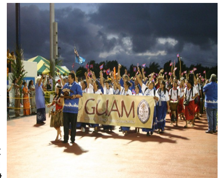
Guam Delegation—Opening Ceremony, 10th FESTPAC, 2008, American Samoa.

Through Public Law 30-83, the Guam Council on the Arts and Humanities Agency a.k.a. CAHA, along with other members of the 12 th Festival of Pacific Arts Coordinating Committee is responsible for: 1) The organization of committee and subcommittees for the implementation of programs and other work deemed necessary for the successful conduct of the 12 th Festival; 2) The preparation and execution of plans, programs and budgets requisite for the preparation for and successful conduct of the 12 th Festival; and the management of funds, equipment and other properties, appropriated loaned, contributed to and raised for the purpose of preparing and conducting the 12 th Festival of Pacific Arts in Guam in 2016. Guam will host the festival and will also be an active participant in all programming events. CAHA's primary responsibility for the 12 th Festival of Pacific Arts is two-fold: 1) to plan, develop and execute the programming for the event; and 2) to oversee Guam's official delegation participation at the festival. CAHA has been holding programming meeting every other month beginning November 2012.